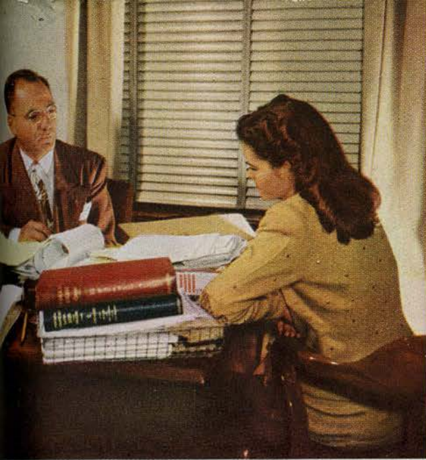
3 Bunny took a room in a private home, hired a lawyer (above) and got a job waiting on table.