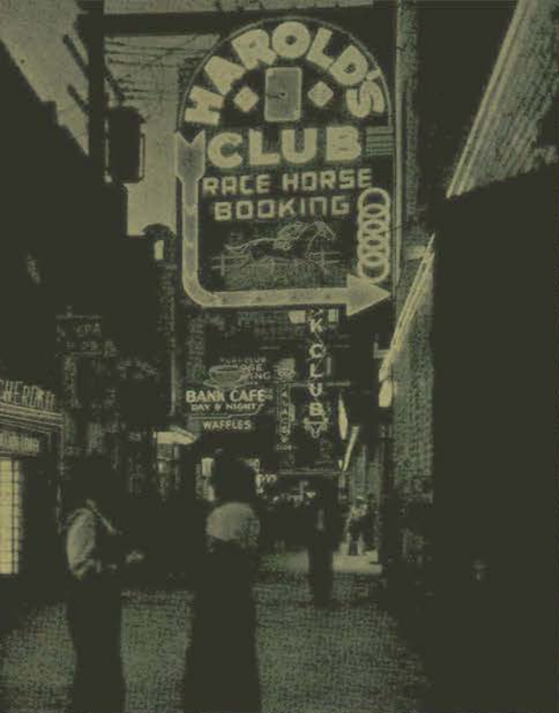
Douglas Alley, crammed with gambling clubs, is called the brightest alley in U. S.