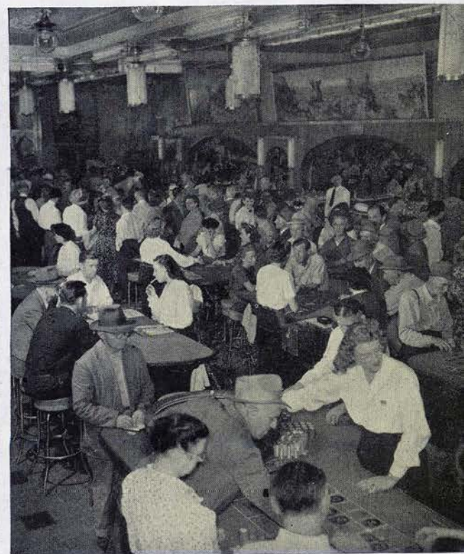
The Palace Club offers 125 opportunities, including 105 slot machines, to lose—or win.

"Oh, no," he said, with an air that came close to being shocked. "Sooner or later you got to feed 'em all back where they came from, and some more too. Thing is, with a loose machine like this a man gets a good playback."