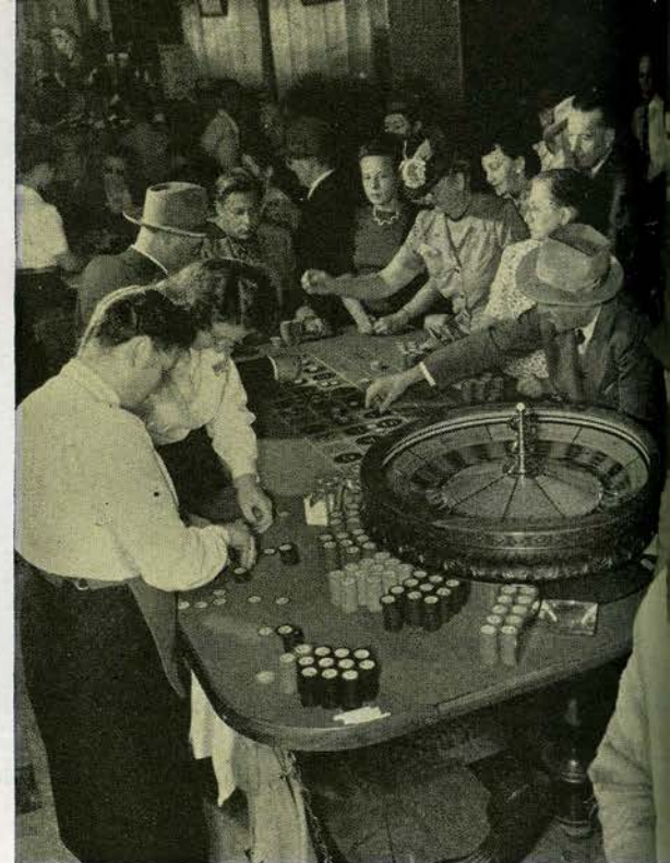
The Palace Club, without a smile in sight. Girl roulette dealers at left earn $15 per day.

Reno gaming clubs are often dreary, and the players seldom gay—win or lose. Yet such