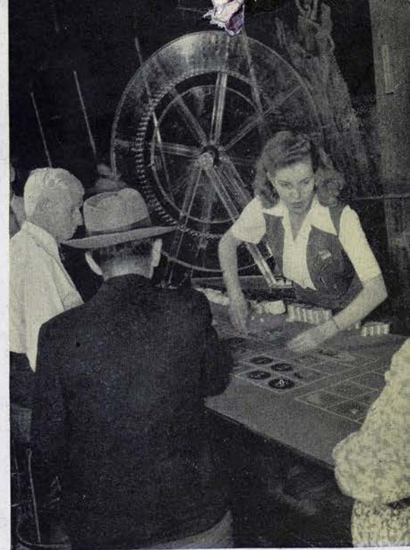
Covered Wagon Wheel, all plastic, was designed in the Harold's Club shops.

is the lure that Nevada's tax on gambling exceeds all other sources of state revenue