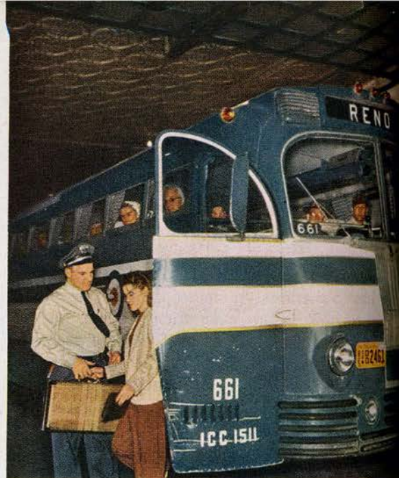
2 Bunny earned her bus fare from Salt Lake City; no one met her upon arrival.

Though divorce in Reno is all but invisible, gambling in Reno is even more visible than the