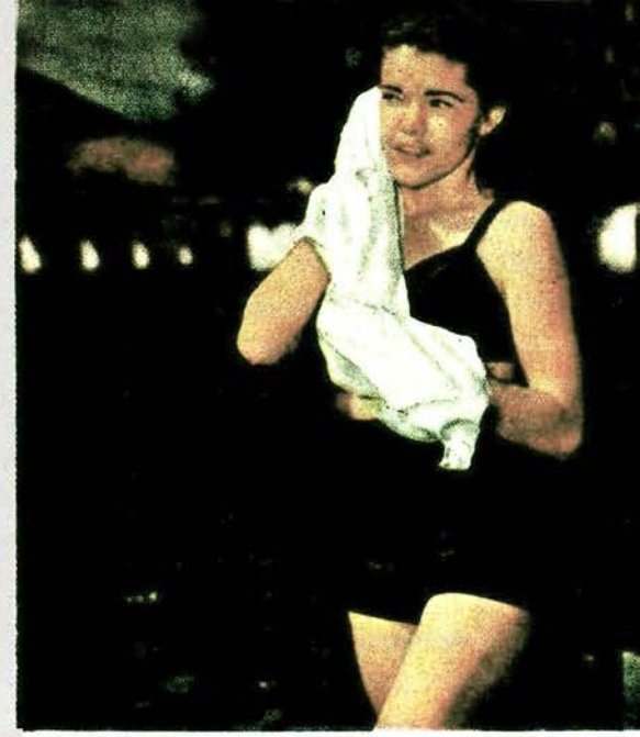
5 Bunny often took a two-mile bus ride to Lawton's pool for an early dip.

cure" the hard way. With no help from husband, she works to pay for her decree