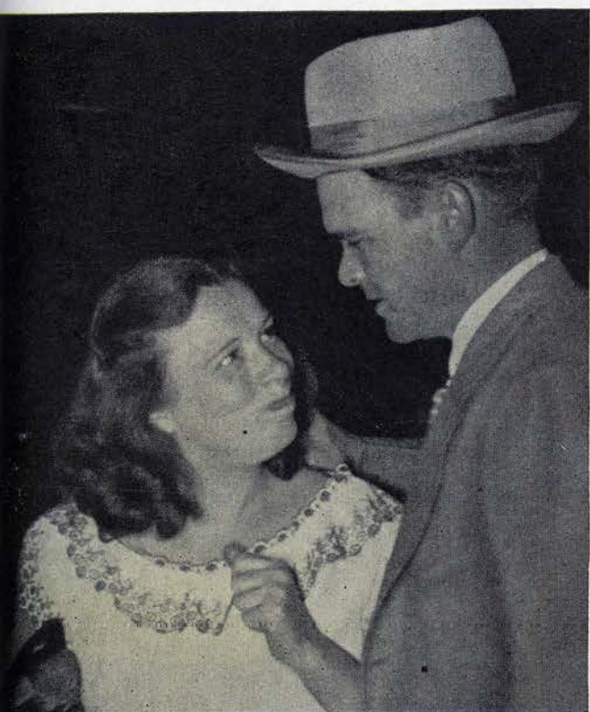
Girl slot-machine player permits a grudging smile; she has just hit the nickel jack pot for $7.

is the lure that Nevada's tax on gambling exceeds all other sources of state revenue