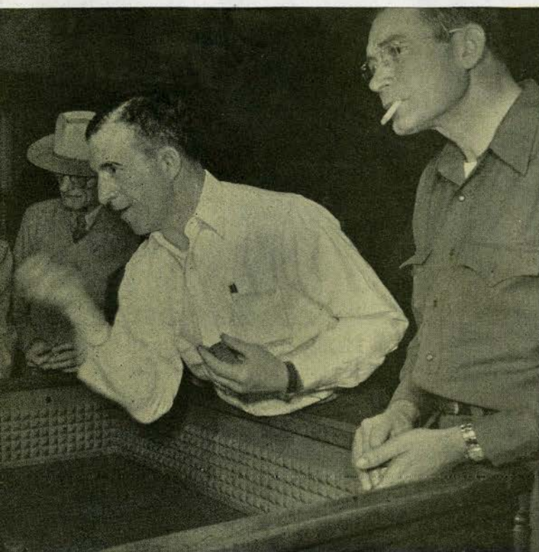
A craps player sweats out a roll at the Palace Club. Some gamblers call craps the fastest, most brutal game.

Reno gaming clubs are often dreary, and the players seldom gay—win or lose. Yet such