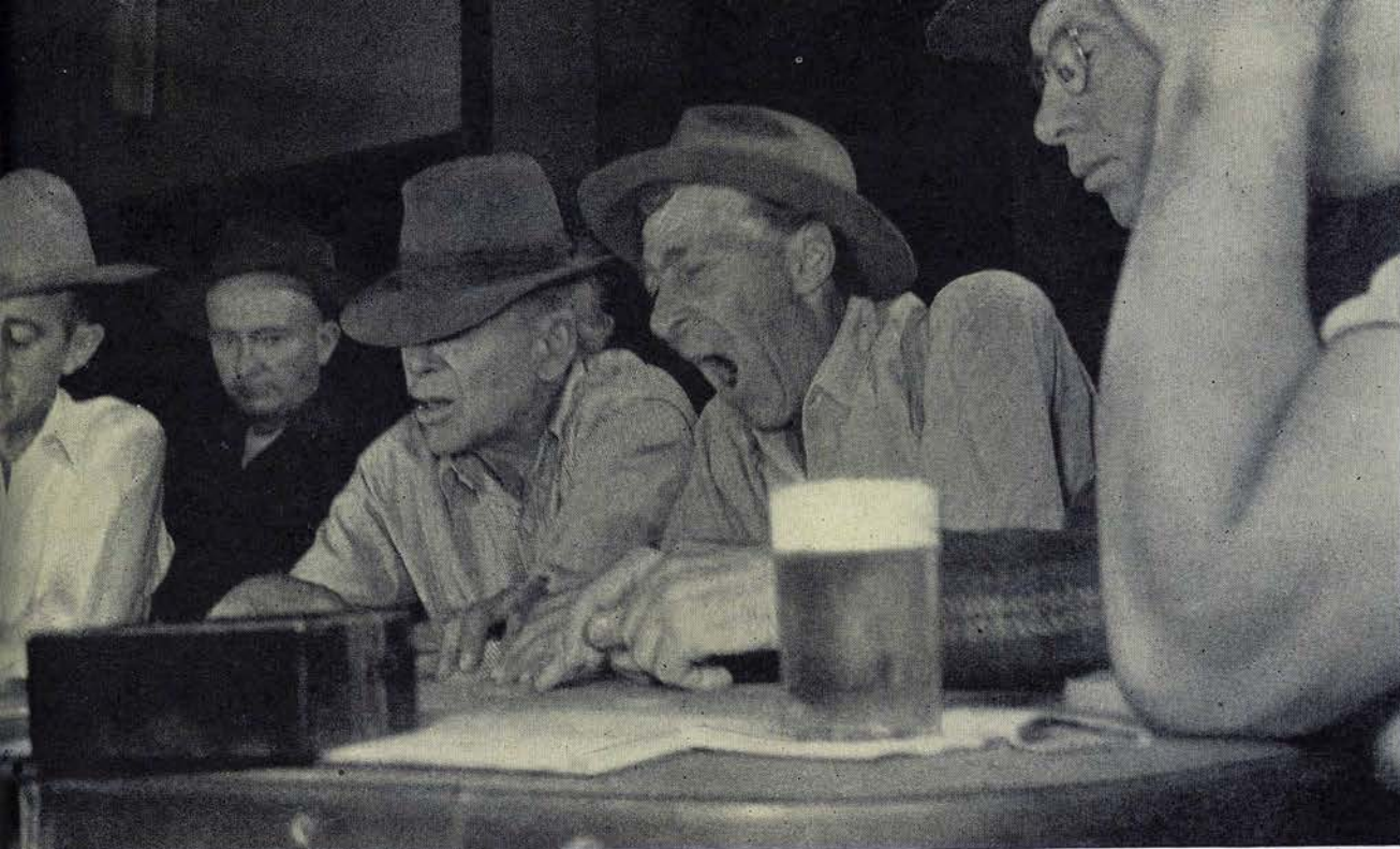
These men have been playing "21" at the Palace Club for 12 hours straight. The club is Reno's oldest; its 300 employees, including 75 skills, work on a 3-shift, 24-hour basis, and earn over a million dollars a year.