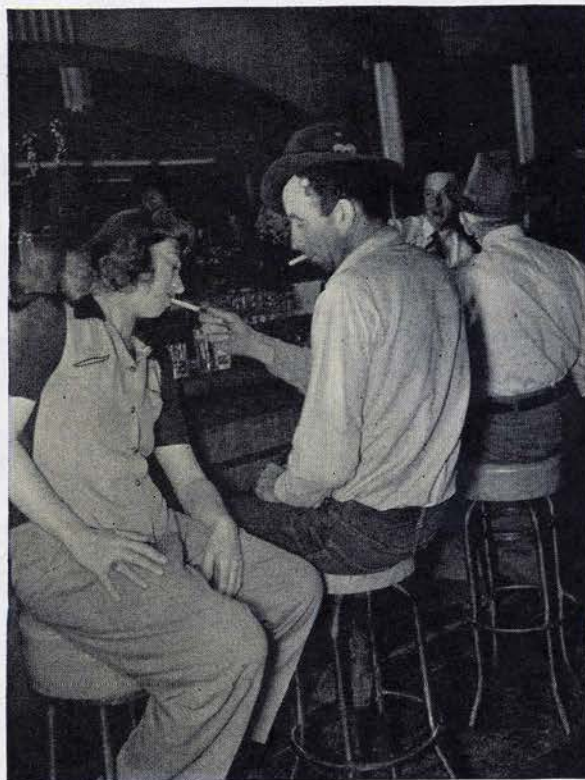
Some operators believe that drinking and gambling don't mix, but every Reno club sells liquor.